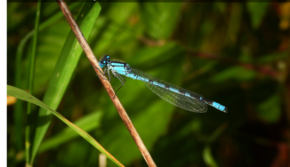
Common Blue Damselfly

5 You soon reach the access gate. Go past it and turn left. At the end of the road cross the main road and go along Green Lane opposite. At the end cross access road into the Lidl supermarket car park, and follow the pavement round to the light-controlled pedestrian crossing. Cross here and continue in the same direction, bearing left into Blackwater station forecourt. At the platform entrance turn right and go up the flight of steps. At the top turn left, cross the railway, and go down the steps the other side. (If you prefer to avoid steps, use the pavement along the main road.)