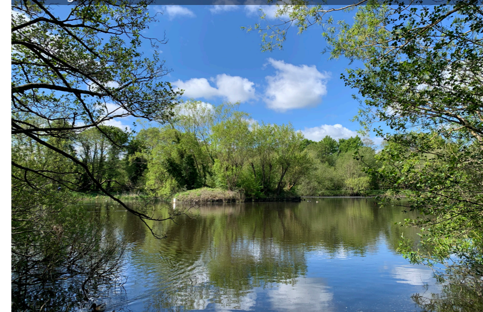
Balancing Pond – Sandhurst Memorial Park

7 To continue the walk, turn left and pick up between points 2 and 3. To return to Sandhurst station, turn right and walk along the road. Immediately before the railway bridge take the paved path to the left, and walk along beside the railway embankment. At the end continue along the gravel track. At the road turn right and Sandhurst station is almost immediately on your right.